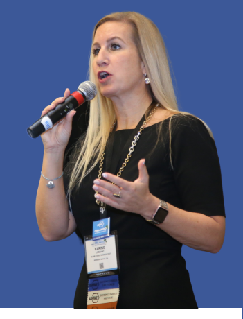
NOT YOUR TYPICAL ENGINEER<sup>™</sup>